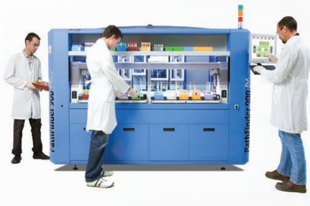
PATHFINDER 900 PLUS